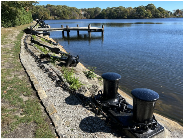
Freshly painted anchors and chains.