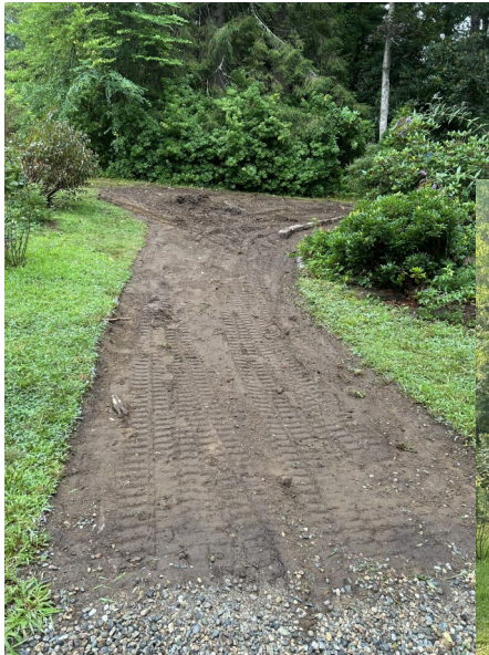
Work on Pollinator Path