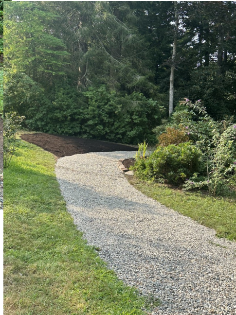
New Pollinator Path