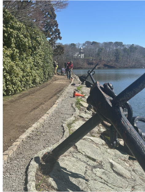
Work on redoing the path